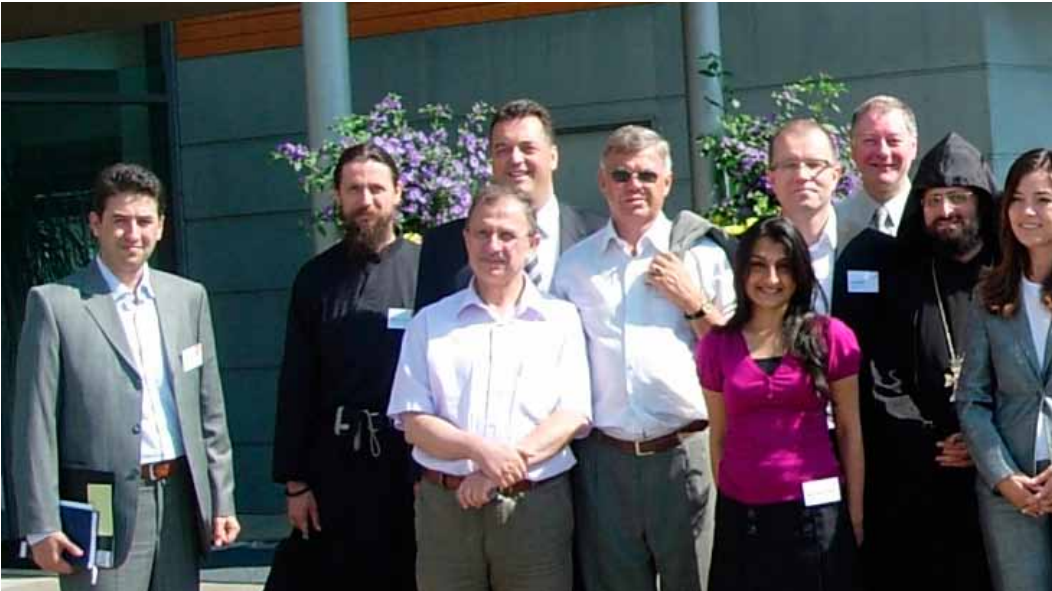
From the conference in 2008