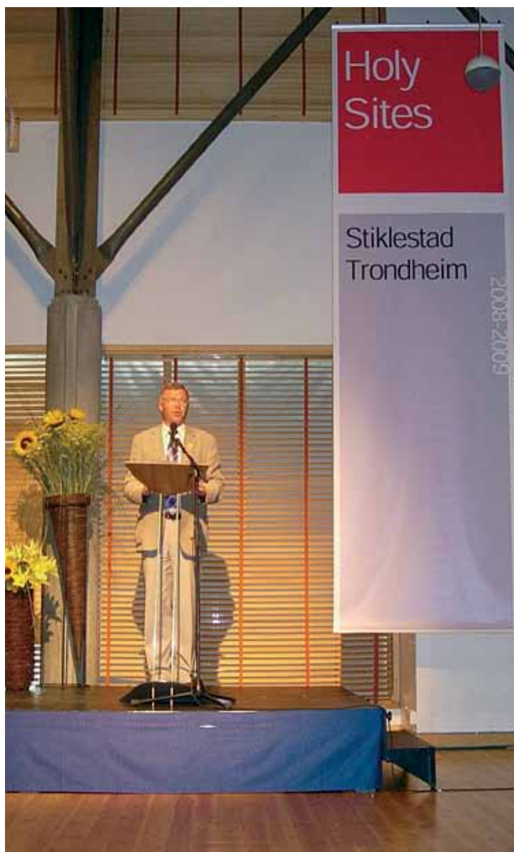
The former Prime Minister and now President of the Oslo Center, Kjell Magne Bondevik giving the opening lecture in Stiklestad