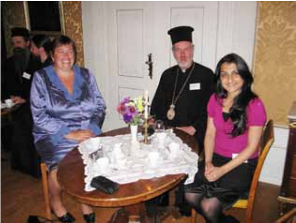
Left: The Mayor of Trondheim, Rita Ottervik as host at Leangen gård Manor