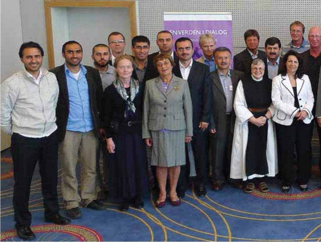
From the conference 2009