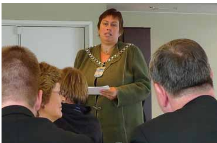
The Mayor of Trondheim, Rita Ottervik welcoming the participants

The first session of the conference was open to the public and press. The opening lecture was given by Bernt Eidsvig, RomanCatholic Bishop of Oslo. Then followed a panel discussion with members from the working group that had reworked the Statement of Intention from 2008 into a draft for a final code on holy sites.