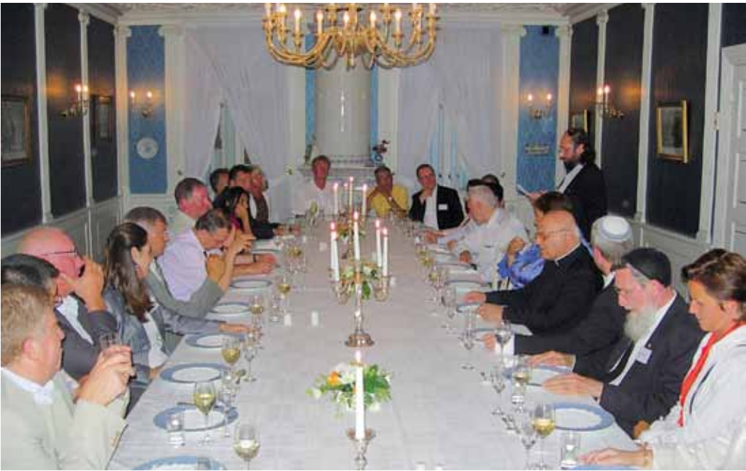
Dinner at Leangen gård Manor